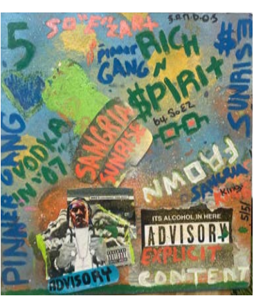
Radio Hakeem" Acrylic, Spray Paint on Speaker 18" x 37" x 11" $350