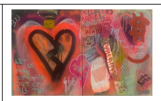
Help Acrylic, Spray Paint on Found Wood 11" x 12" x 1" $sold

Villains Arent Always Villains Acrylic, Spray Paint on Canvas 32" x 20" x 1" $200